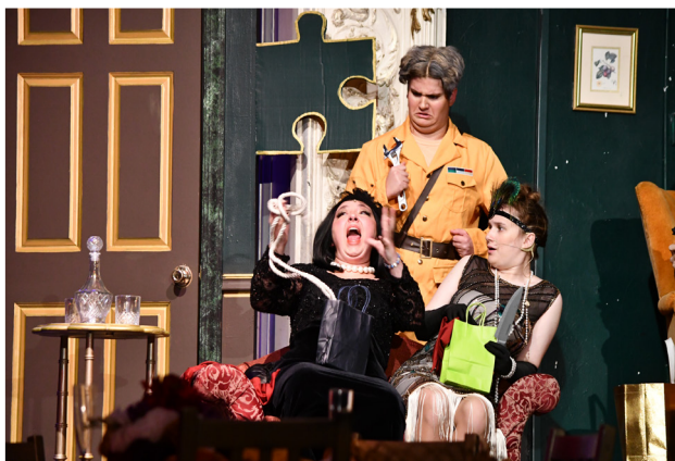
Mrs. Peacock and Colonel Mustard are aghast at Mrs. White's reaction to her "gift," as she thinks at first that it is a snake, then realizes it is a rope.