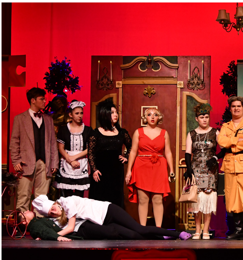
(From left)- Professor Plum, Yvette, Mrs. White, Miss Scarlet, Mrs. Peacock, and Colonel Mustard look on, perplexed as the murdered Cook ends up falling on top of poor Mr. Green.

Don't forget to see Anything Goes in the spring!