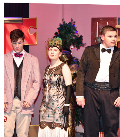
As more dead bodies keep showing up, Professor Plum, Mrs. Peacock, and Wadsworth start to realize that their evening at Boddy Manor is closing in on them.

With its multiple rooms, it made the audience feel as if they were inside the mansion with the characters. The stunts were also a big part of the show, between the falling chandelier and the "murders."