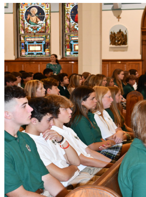
Freshmen welcomed on their first week.