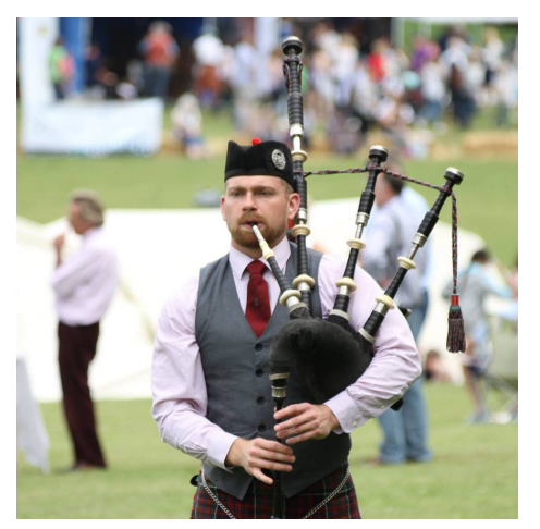
Performing at TBD