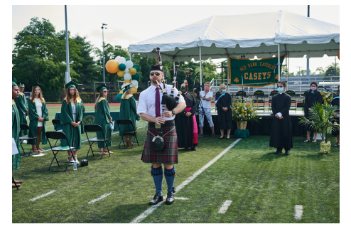
Performing at RBC