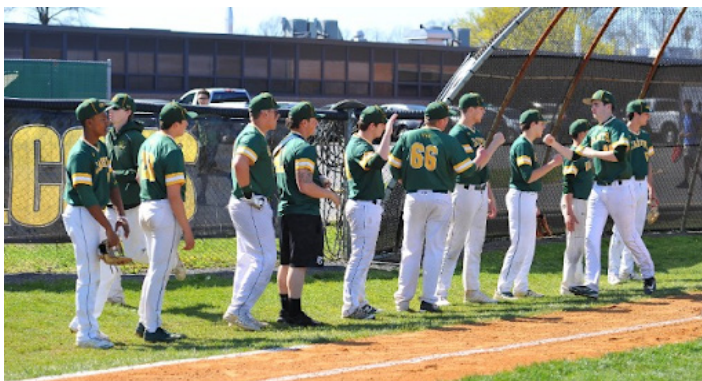
The boys warm up before the Autism Awareness Baseball Challenge.