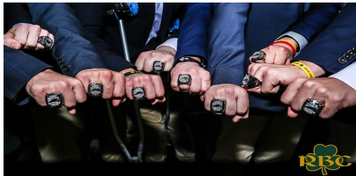
Members of the football team pose with their championship rings.

This is in part due to their undefeated 11-0 season and State Championship.