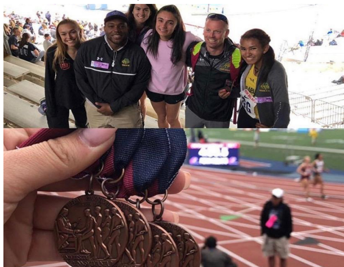
The 4x400 relay takes third with a time of 3:55.04 at Penn Relays.

The RBC Track Team has returned for another eventful season this spring. As most of the team was returning from the winter season, the team was projected to perform extremely well.