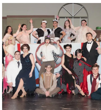
The performers pose at the end of an amazing show.

The musical numbers, singing, and dancing by the ensemble were superb. All of the hard work put in by the production staff and stage crew paid off when the audience burst into laughter and applause. This was one of the most remarkable shows that RBC has displayed.