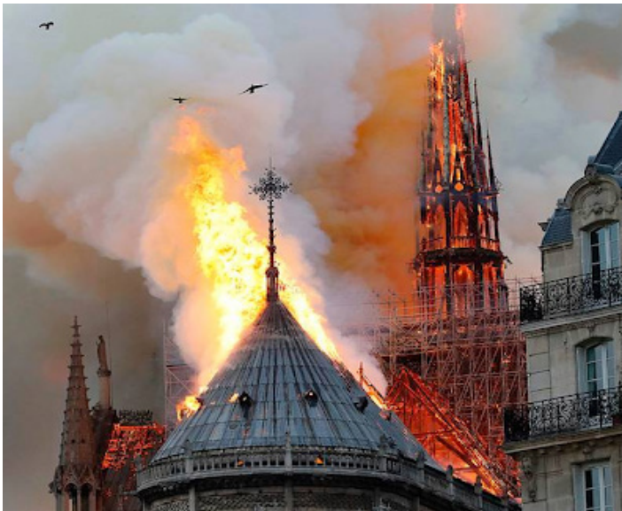
The Notre Dame Cathedral disaster in Paris, France burning.

As a community, we can continue to offer our prayers.