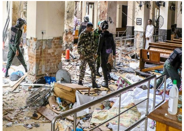
An inside view of St Anthony's Shrine in Kochchikade, Colombo, after one of the bombings in Sri Lanka.

has carefully addressed the issue while refusing to speculate on the perpetrators. Additionally, the government has worked to prevent social media theories from spreading false accusations. Recent news has confirmed that multiple suicide bombers and two bomb experts were the source of the violence on Easter in Sri Lanka, and all of those directly involved with the bombings are dead or arrested. One of the churches targeted has partially reopened, allowing for people to pray and continue to heal from this tragedy.