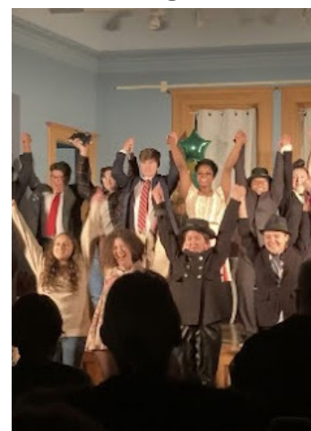
Performers from the After School Theater Group take a bow after their hilarious rendition of a zany scene from the comedy You Can't Take it With You .